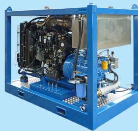
Good access for maintenance